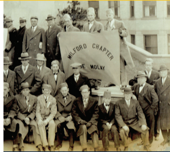
Milford Chapter, DeMolay Degree team circa 1925