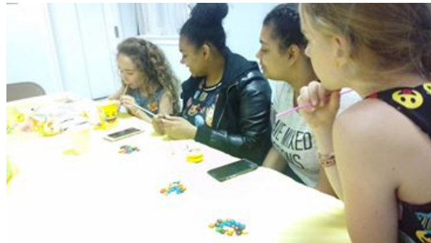
Our Pledge girls with Our Rainbow girls and Advisors playing games at our Emoji Party!

If you would like to know more, please contact: