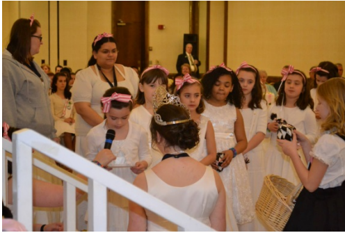
Pledge girls doing a presentation to the Grand Worthy Advisor

Girls ages 6-10 are called Pledges. Though they cannot become a full Rainbow Girl until age 11, they are welcomed and encouraged to participate in many activities including charity work, installations, and many other assembly activities. At this stage, the pledges enjoy the “big sister” relationships they will form with the older girls as they work and play side by side, absorbing the positive energy that comes from being a good person inside and out.