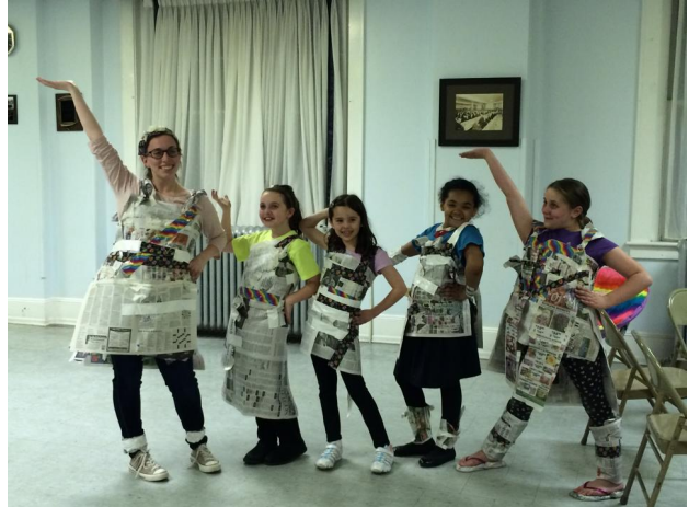
Our Past Grand Worthy Advisor in a fashion show with our pledge girls