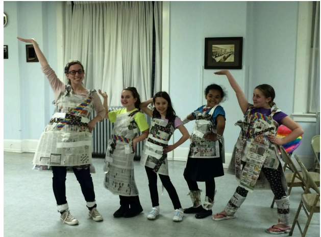
Our Past Grand Worthy Advisor in a fashion show with our pledge girls